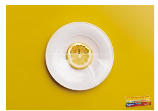
Figura 1. Ziploc: Be fresh for a long time

An archetype as such, one that evidences the essence of the work in an abstract way, can be extracted from imitations or lookalikes, which show that the underlying idea may be the same but expressed in different ways, or the opposite, that a similar materialization can express different ideas.