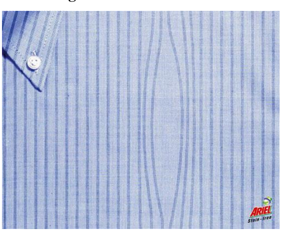
Figura 3. Ariel: Stain-Free

In the second example, Figures 3 and 4, the idea is also the same but visually the images are different. These are two ads for detergents, both of which play with the idea of stains trapped in bar cells (striped shirts). In the first case, the stain has already been released; in the second, the stain even has a way to hold onto the bars and is still caught.