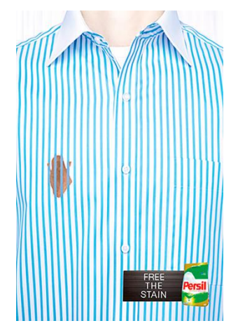
Figura 4. Persil: Free the stain