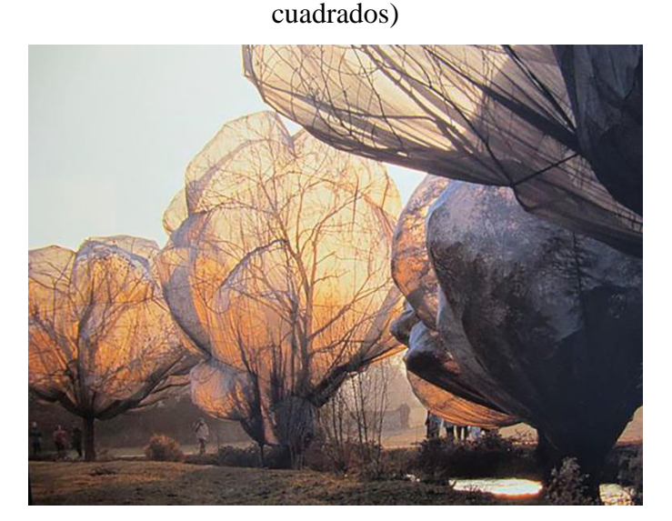
Figura 9 . Intervención temporal Verhüllte Bäume en el parque Berower de la Fundación Beyeler (fotografia de 178 árboles envueltos en un área de 55 000 metros